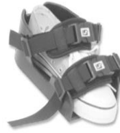
Shoe Holder with Tendon Relief