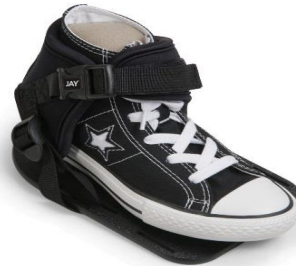
Ankle Positioning System