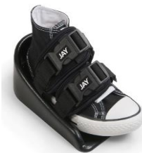
Shoe Holder with Padded Straps