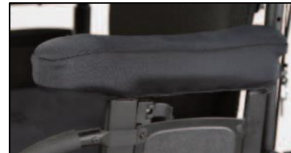
Armrest Gel Pad Cover