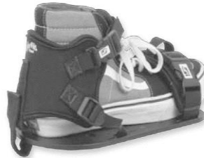
Foot & Ankle Positioning