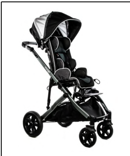
For Moderate Seating See Section 2