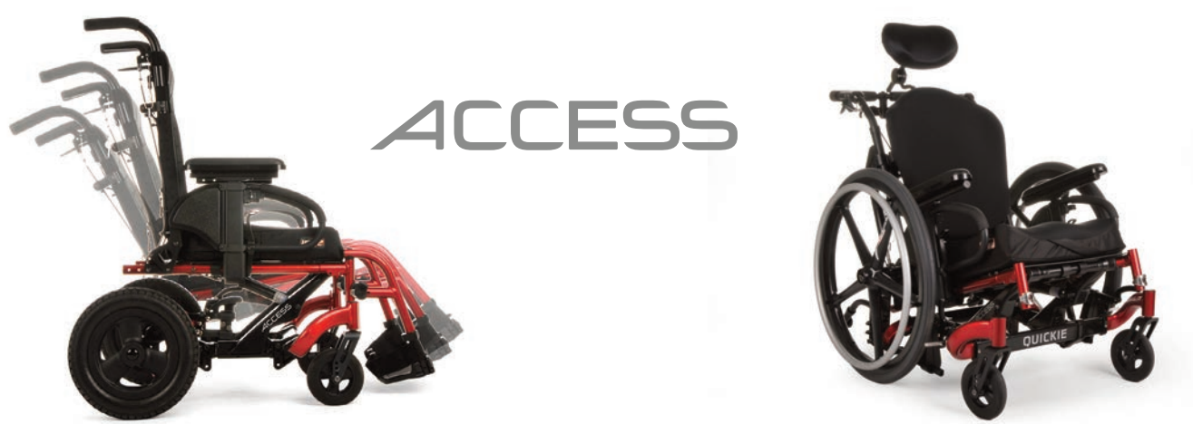
The QUICKIE ACCESS is the only knee-pivot chair with two tilt ranges (-5° to 20° and 0° to 25°).

With an understanding of this research, QUICKIE<sup>®</sup> developed the Access.