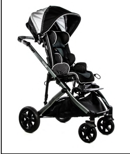
For Moderate Seating See Section 2