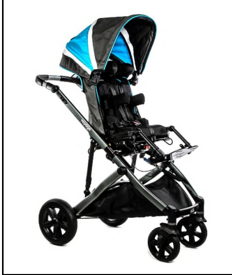
For Advanced Seating See Section 3