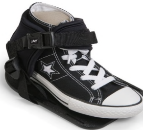
Ankle Positioning System