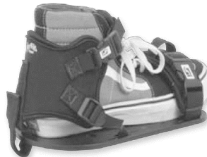
Foot & Ankle Positioning