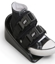
Shoe Holder with Padded Straps