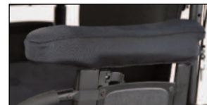
Armrest Gel Pad Cover