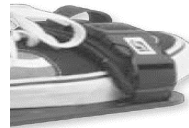
Padded Ankle Toe Strap Only