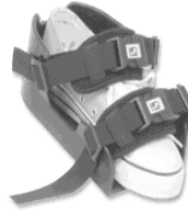
Shoe Holder with Tendon Relief