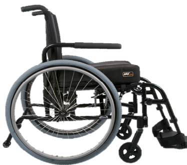
Quickie QXi, Ultra Lightweight Adjustable Folding Wheelchair