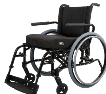
Quickie QXi featuring the Jay ION™ cushion