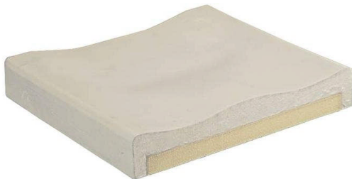
Cross section view

The JAY GO foam base is designed to contain an accommodating seating surface in a thicker, softer dual layered foam base. The optimal combination of two different foam densities provides skin protection.