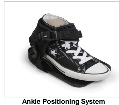
Ankle Positioning System