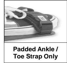
Padded Ankle / Toe Strap Only