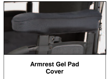
Armrest Gel Pad Cover