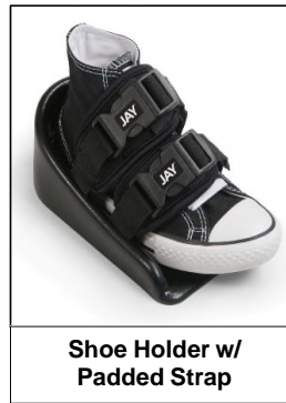
Shoe Holder w/ Padded Strap