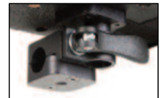
Swing Away Hardware