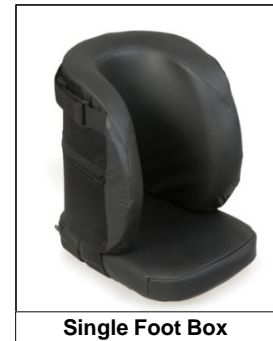
Single Foot Box