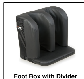
Foot Box with Divider