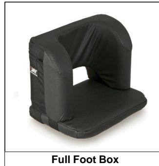
Full Foot Box