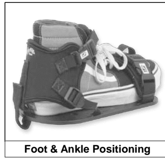
Foot & Ankle Positioning