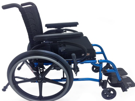
Quickie QX, Ultra Lightweight Folding Wheelchair