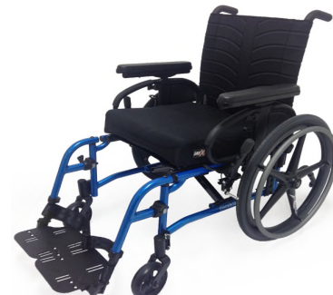
Quickie QX featuring the Jay X2™ cushion