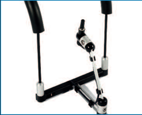
Mini Joystick on Chin Harness