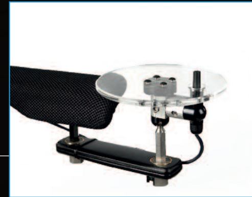
Mini Joystick on a SunDisk