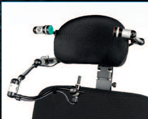
Adjustable Chin Mount plus Head Controls