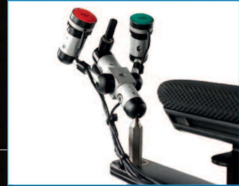
Mini Joystick with Extra Switches