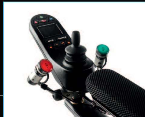
Extra Switches with a Standard Joystick